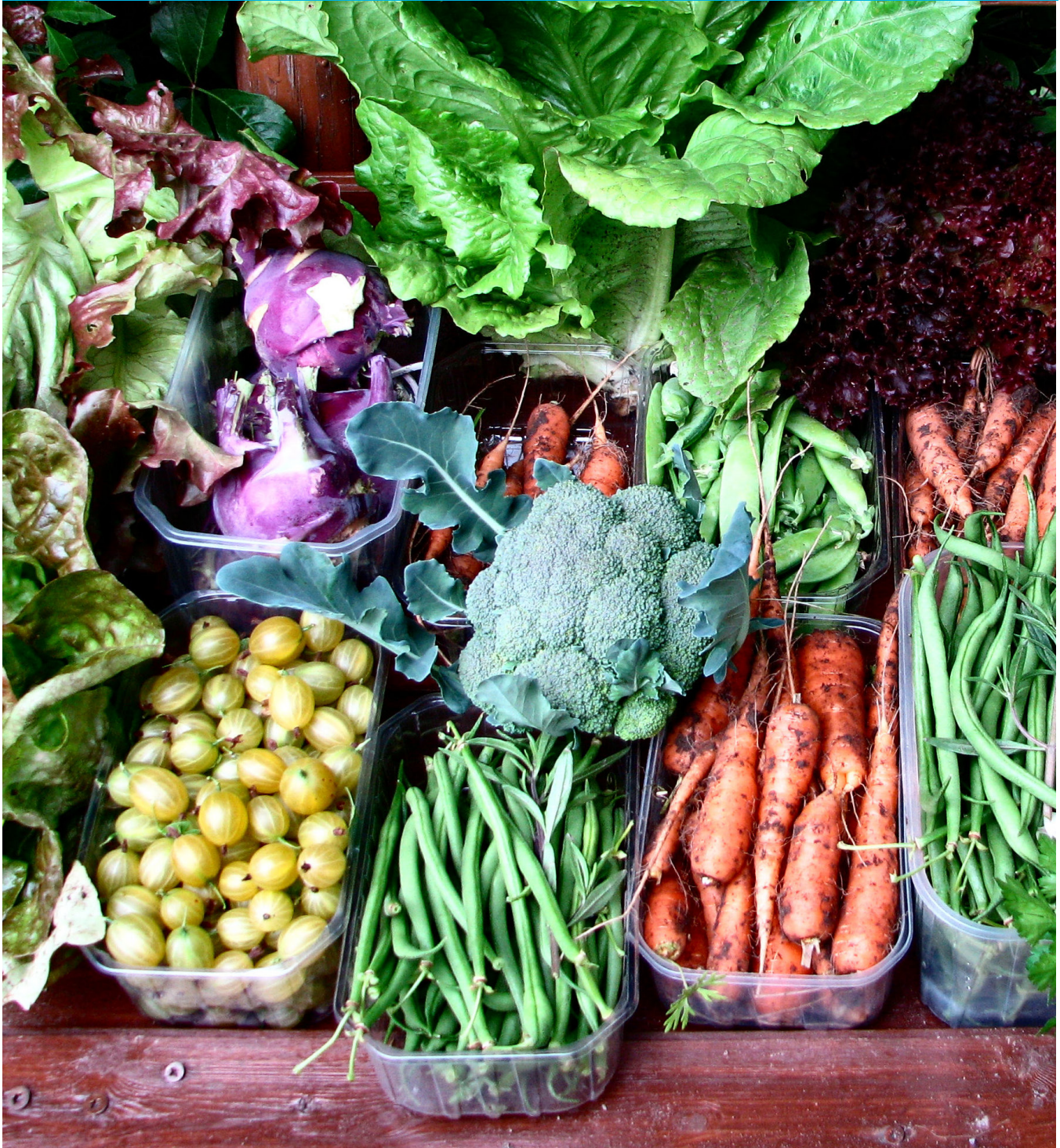
DAILY VEGETABLE HARVEST BY ANDREAS IS LICENSED UNDER CC 2.0